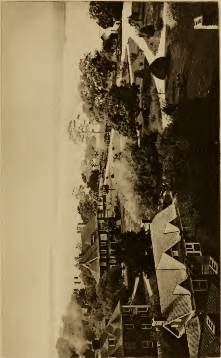
FROM CLUB HOUSE LOOKING SOUTH